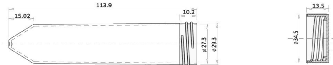
Centrifuge tube 50 mL, Flat Cap